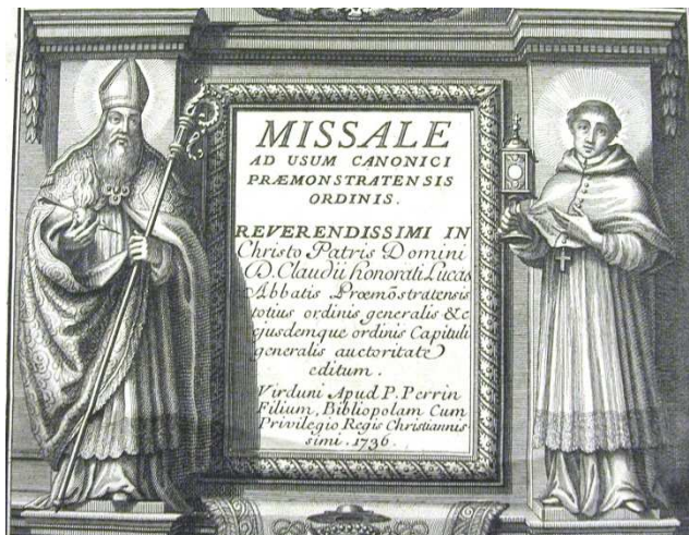
Norbertine Missale from 1736.