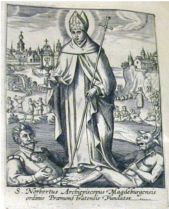
Life of Saint Norbert.