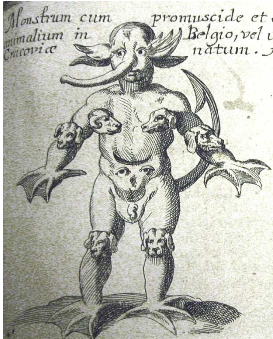
Sacred world or secular world (or both)?